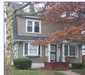
Donald Axinn INN, Emergency Men's Shelter

The INN operates three emergency shelters: two of these shelters are for families and one is for single men. All offer temporary refuge and supportive services for homeless individuals while they reside as guests in a home-like environment. With staff support, the guests search for a home while working or seeking employment.