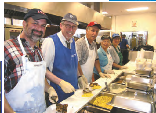
Volunteers at an INN Soup Kitchen