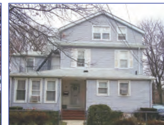
Rosa Parks INN, Emergency Family Shelter